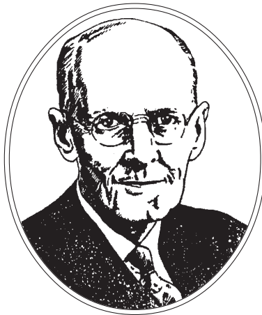
Paul P. Harris Founder of Rotary