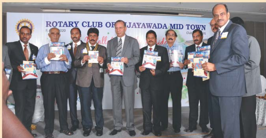
Releasing of Club Brochure & Flash