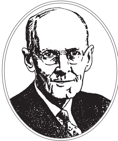
Paul P. Harris Founder of Rotary